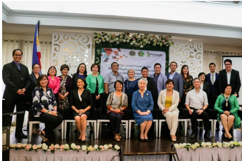
The HTAC at the HTA High-Level Policy Forum Sulo Riviera Hotel, 31 October 2019