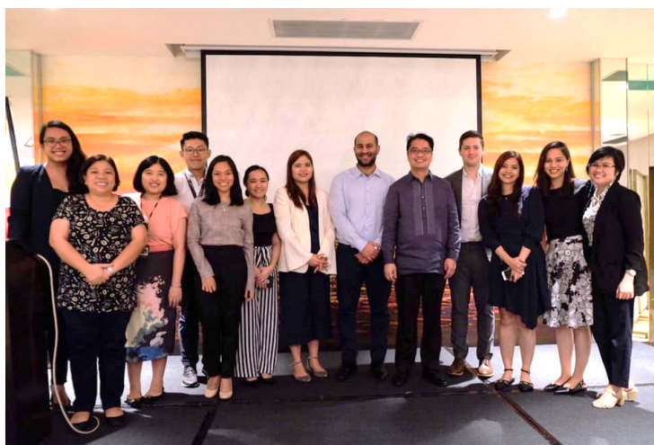
HTA Symposium and Workshop with Imperial College London Hotel Jen, 14-18 January 2019