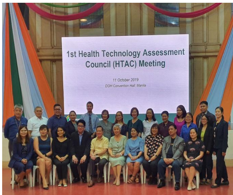
HTAC's first meeting with the SOH 11 October 2019, DOH Convention Hall