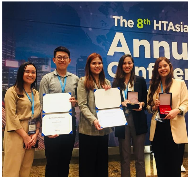
The Philippine delegation for the HTAsiaLink 2019 26 April 2019