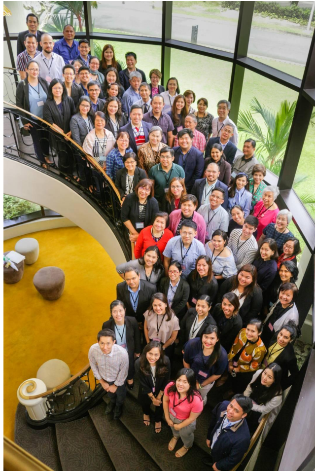
Attendees of the Evidence Appraisal Workshop Quest Hotel, 28-30 October 2019

Torres-Edejer). Attendees were members of HTAC, HTAU, and representatives from PhilHealth and DOST.